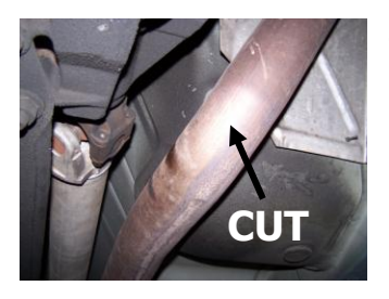
3. Then cut over axle tail pipe before axle and remove.

2. To remove the stock exhaust, cut off your stock over axle tailpipe just at the muffler. Then remove hangers from rubber grommets and remove muffler assembly.