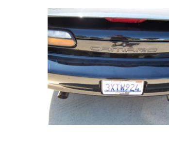
8. Install stainless steel tips. Clamp down. When you have everything in place, firmly tighten all bolts and clamps down securely. Use stainless steel cleaner and a Scotch Brite pad weekly to prevent tip from discoloration. Inspect all fasteners after 25-50 miles of operation and re-tighten as necessary.

GIBSON EXHAUST systems are designed on a factory stock vehicle. Any aftermarket products installed could increase the sound levels of this Exhaust. Make sure there is a 1" clearance from ALL rubber brake lines, shock boots, fuel lines, tires, etc to prevent heat related damage or fire.